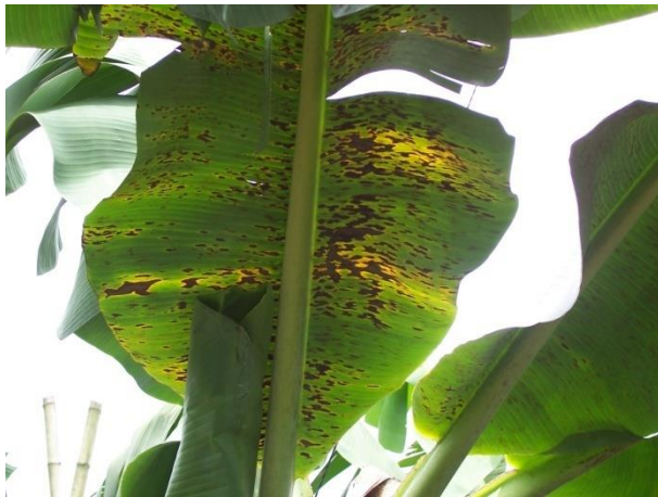
With Non Ionic Surfactant – 6 WAT